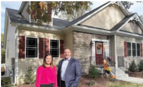
Bello Machre's Central Lane Home financed by the Community Bank of the Chesapeake.

Bello Machre is pleased to announce a $50,000 charitable giving commitment from Community Bank of the Chesapeake (CBTC), payable over the next three years. CBTC's gift to Bello Machre is the latest in its four-year giving history to the organization. When this latest commitment is completed, CBTC will have contributed nearly $90,000 since 2017, in support of Bello Machre's Every Step Counts, Golf Tournament, and 50th Anniversary Celebration. 🌻